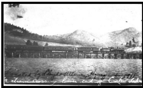
After: This photograph has been enhanced to show more details of the Great Northern train