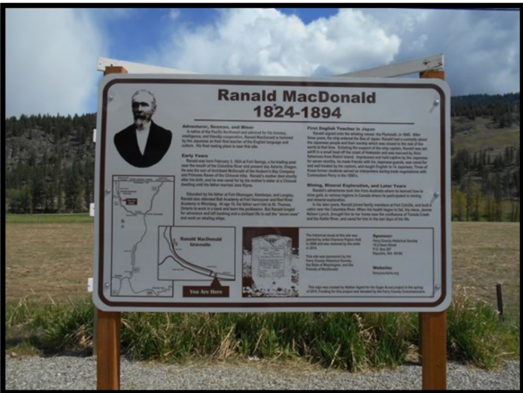
The new sign and support system for the restored panels

There will be a FCHS yard work day at the J.W. and Elizabeth Slagle House on Saturday, June 20th from 10:00 A.M. to 2:00 P.M. All members and other volunteers are welcome. Please remember to bring your gloves.