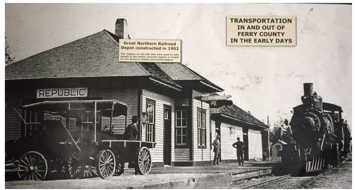
Great Northern engines at the Republic depot

Watch the Summer Nugget for an account of the GNRHS two day visit to Republic, Curlew and local Great Northern sites. It was great fun and introduced a valuable new partner in our efforts to interpret Ferry County's history to the public.